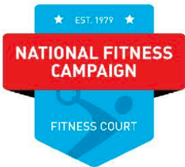
National Fitness Campaign