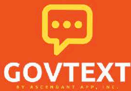
GovText Ascendant App, Inc.